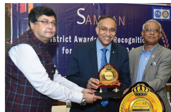
Highest contributor to TRF, 2020-21

He has received meritorious recognitions on numerous occasions from RC Calcutta Victoria for his continued and sustained efforts for the upliftment of women's health (Mother & Child, Women's Empowerment: Save the Girl Child, Violence against Women and Prevention of Cervical Cancer) by organising health check-up camps and awareness programmes since 1997, and for providing free HPV vaccination